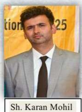
AP Pol. Science